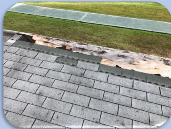
Quantico Shooting Club