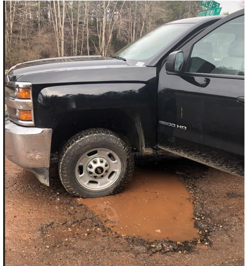
MCB-3/G-DEMO RD. ASPHALT/HARDBALL: FEB 2019