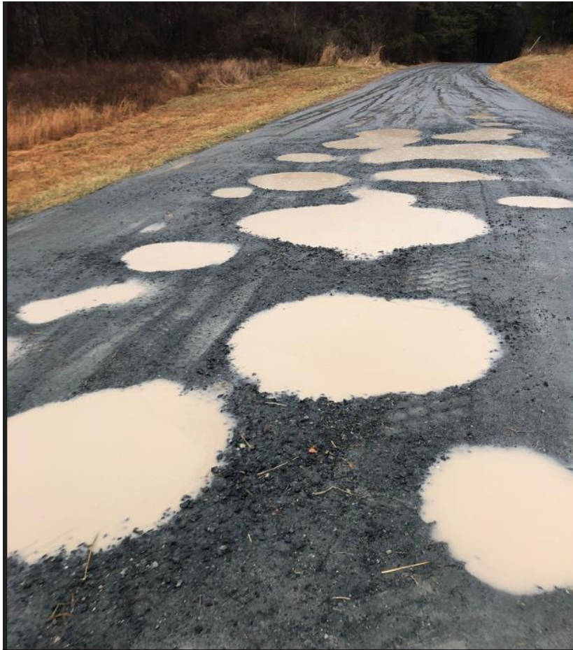
TOKYO ROAD: GRAVEL/IMPROVED: FEB 2019