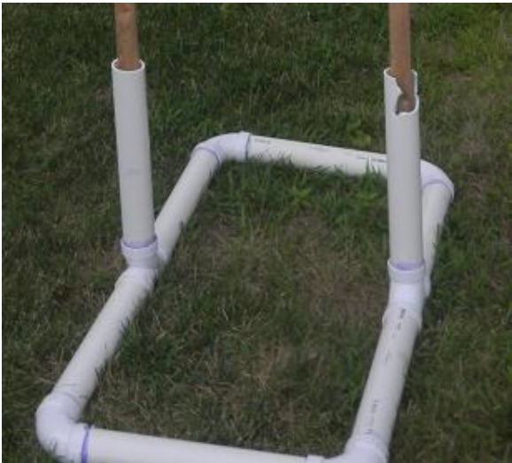
Lower section made of 1 ½ inch PVC

To be certain your target stand is usable, we highly recommend targets with NO METAL whatsoever. Here's an example: