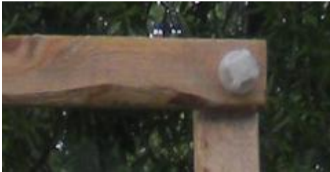
Upper section made of wood and nylon (these are toilet seat screws).